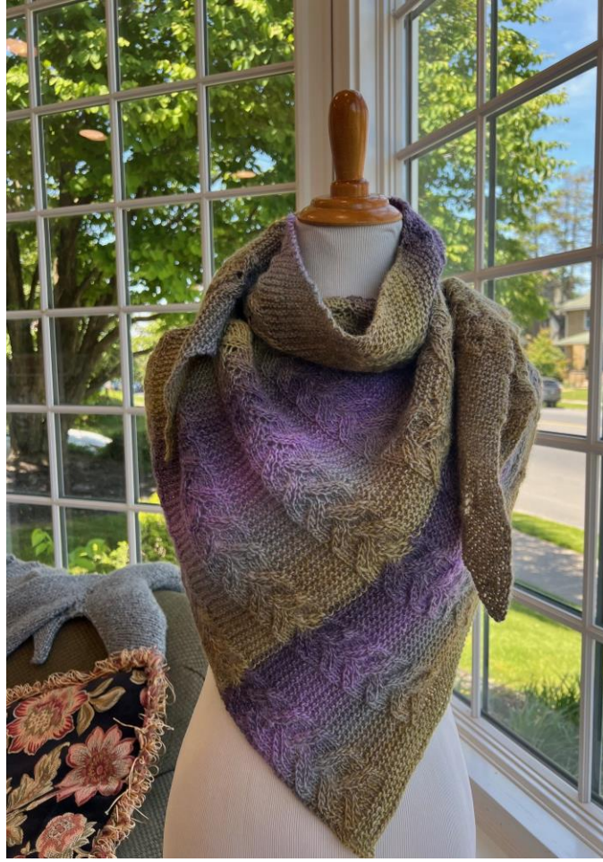
Row 8: K to marker, sm, p7, yo, p1, p2tog, end k2.